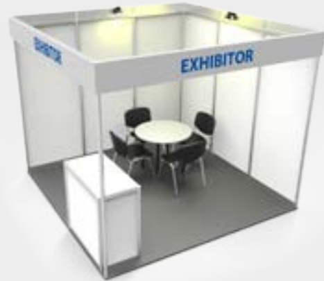
Exhibit space, shell scheme 3x3 m – white walls with aluminium frame, grey carpet, an information counter, a table with 4 chairs, 2 spotlights, a trash can, name board, power supply up to 2kW, daily stand cleaning

CORNER PACKAGE 20 m 2 Discounted price: 5 640 EUR